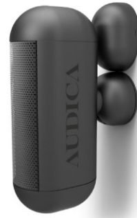
100V Adaptor with MICROPpoint