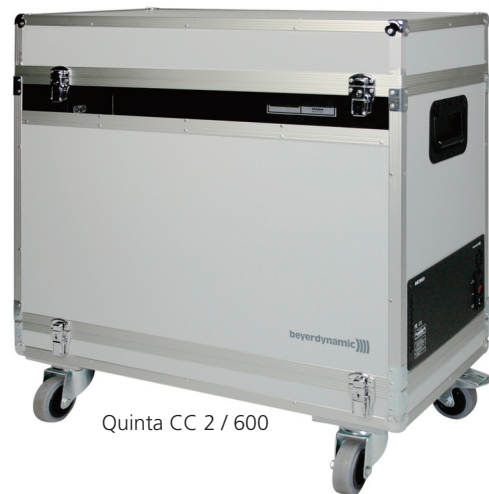
Quinta CC 2 / 600