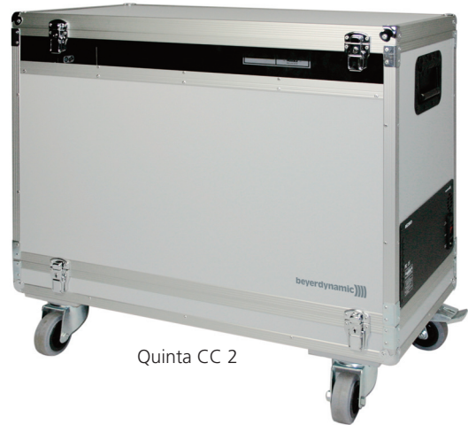
Quinta CC 2

The body of the case is made of plywood with a washable foil inside and "Oslo" silver-grey laminate outside. The case is equipped with ball bearing casters with a diameter of 80 mm. Two of the casters are equipped with brakes. Silver anodised aluminium profiles protect the edges from shocks and ensure an exact fitting of the individual sections. There are four locking chromium-plated automatic locks per section. For charging the microphone units are put into the charging facilities. Shock-mounted charging contacts ensure the electric connection between microphone unit and power supply unit. All batteries are charged simultaneously. After approximately 2.5 hours the battery is fully charged, depending on the previous use. The charging state of the batteries is indicated by the LED ring of the gooseneck microphone and can be seen from the outside through a glass panel or when the cover is opened. To avoid a self-discharge of the batteries, trickle charging is carried out. So each microphone unit has its full capacity at any time. Therefore, beyerdynamic recommends the charger being connected to the mains permanently.