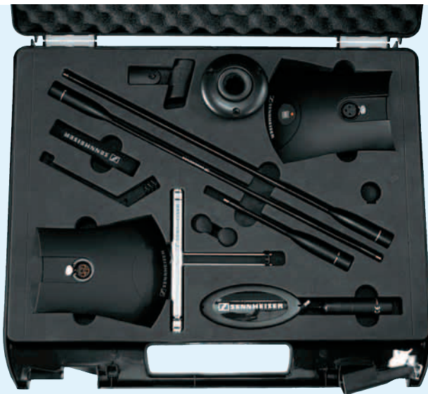
Installed Sound Base Kit XLR-3