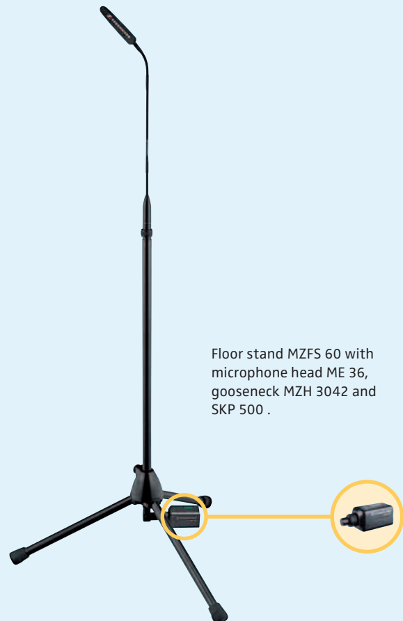
Floor stand MZFS 60 with microphone head ME 36, gooseneck MZH 3042 and SKP 500 .