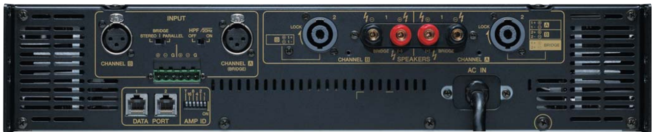
PC9501N Rear Panel