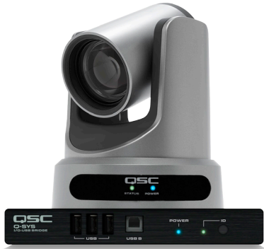
I/O-USB Bridge not included